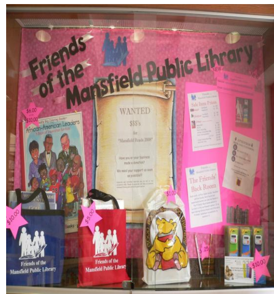
Our current display case!

We want people to know that our library has Friends!